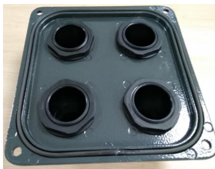
Fig.3. Spare AC Sealing Plate