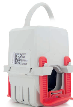
Cable split core current transformer