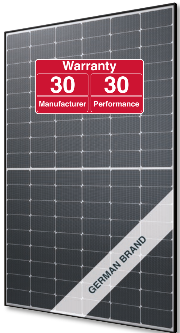
Fig. similar 108TGBLEN240422A