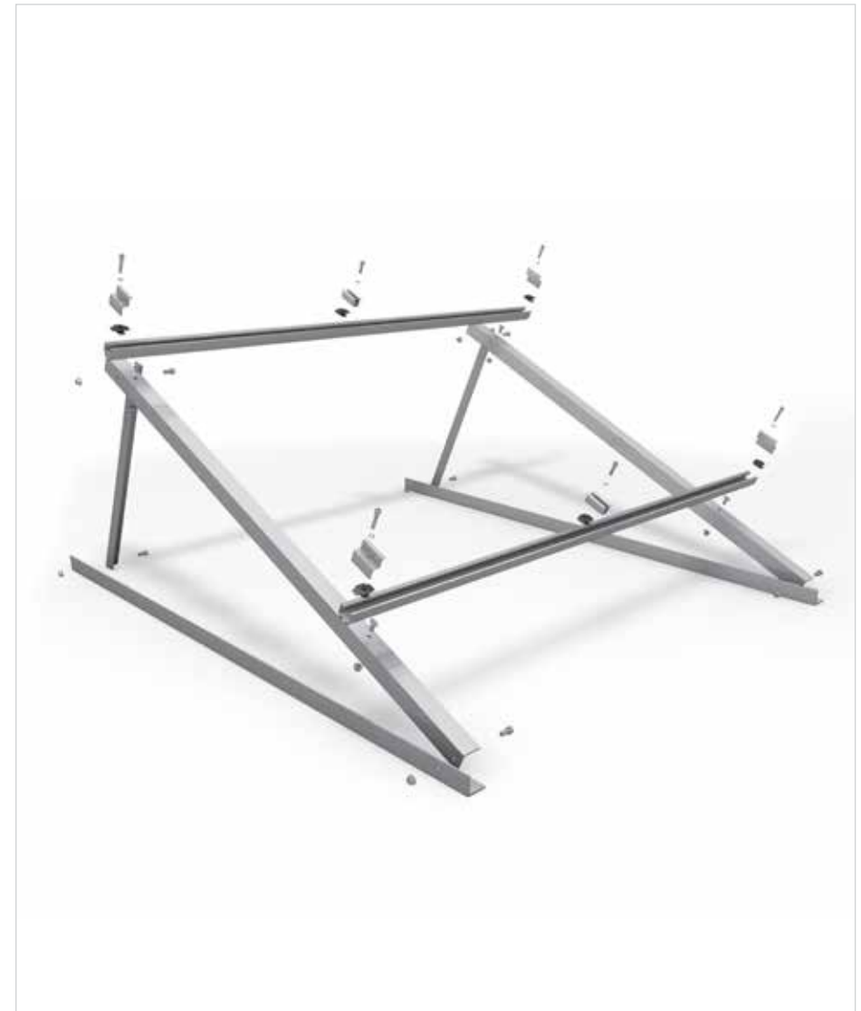
System Explosion drawing