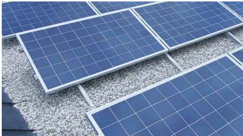
Elpo | Seis - Italy System: 5.76 kW | Triangle System