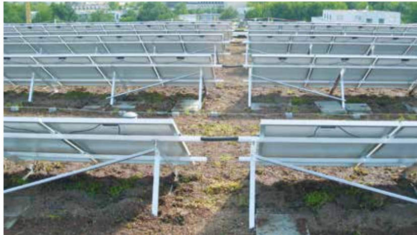
Tittmann Solar | State Theatre Stuttgart - Germany System: 112 kW | Triangle System