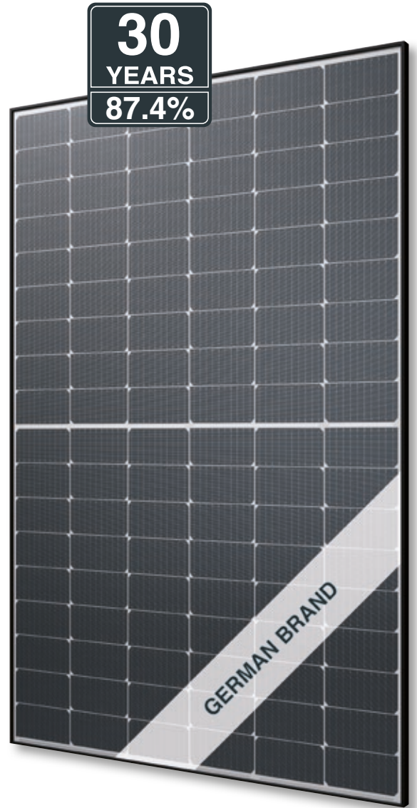
Fig. similar 08TFMEN231004A