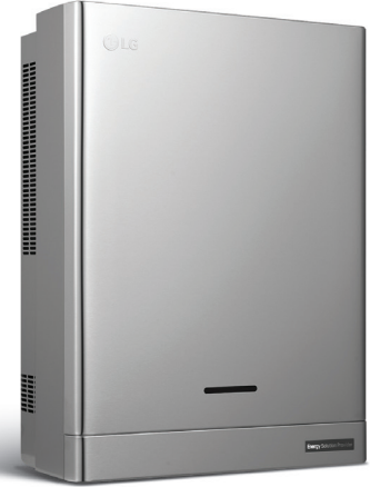
PCS (D008KE1N211) (D010KE1N211)