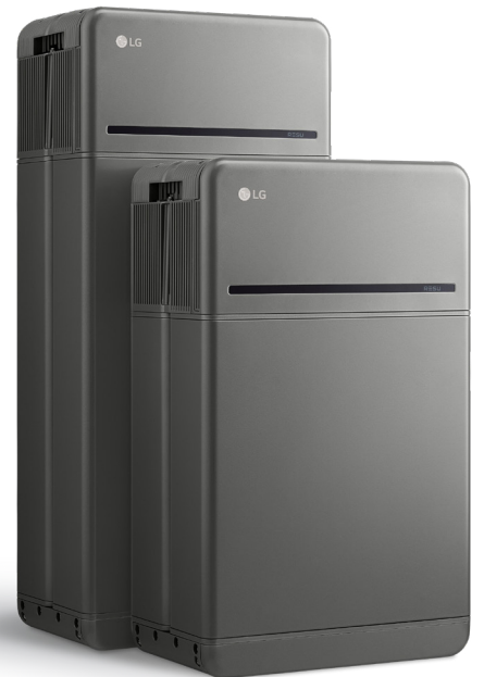
LG HBP battery (BLGRESU10HP) (BLGRESU16HP)